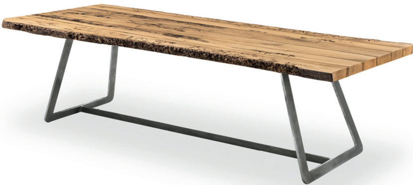
Table with top in Briccola planks, not glued, with natural sides combined with an iron base, light colour, consisting of two U-shaped legs and a central bar.

STANDARD VERSION: BRUSHED NATURAL IRON BASE, LIGHT COLOUR, MATT TRANSPARENT LACQUERED (B2)