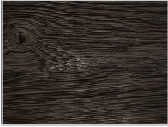
oak: with knots vulcano