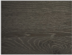
oak with knots pigmented: ash grey