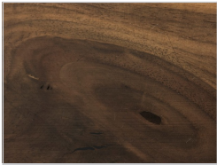
walnut with knots