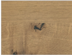
oak with knots finish: neutro