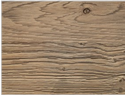
oak with knots finish: vintage