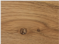
oak with knots