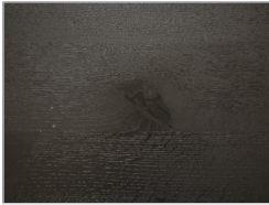
oak with knots pigmented: total black