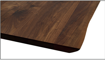
DETAIL: TOP WITH NATURAL SIDES