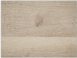
oak with knots pigmented: white milk