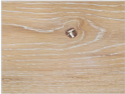
oak with knots finish: whitened