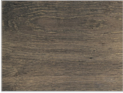
oak: flamed london