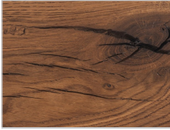
oak: with knots tabacco