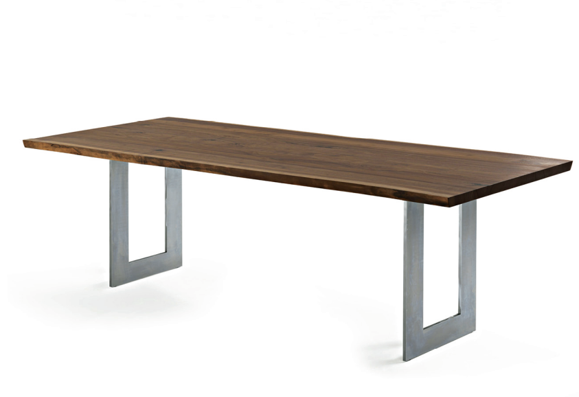
Table with solid wood top in glued lists with natural sides, combined with an iron base, light colour, consisting of two flat legs.

STANDARD VERSION: BRUSHED NATURAL IRON BASE, LIGHT COLOUR, MATT TRANSPARENT LACQUERED (B2)