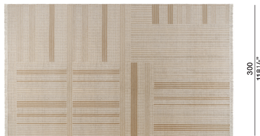
500 196 7/8" 528 with fringes 207 7/8" with fringes