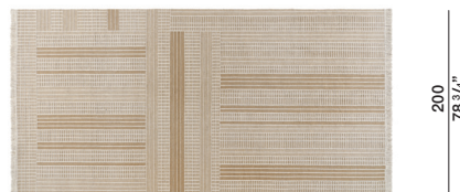
400 157 1/2" 428 with fringes 168 1/2" with fringes