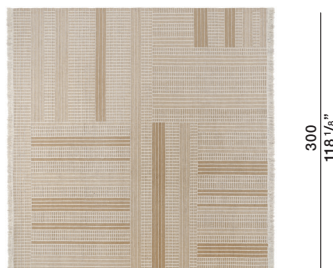
300 118 1/8" 328 with fringes 129 1/8" with fringes