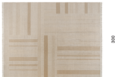
400 157 1/2" 428 with fringes 168 1/2" with fringes